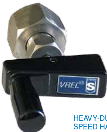
HEAVY-DUTY SPEED HANDLE