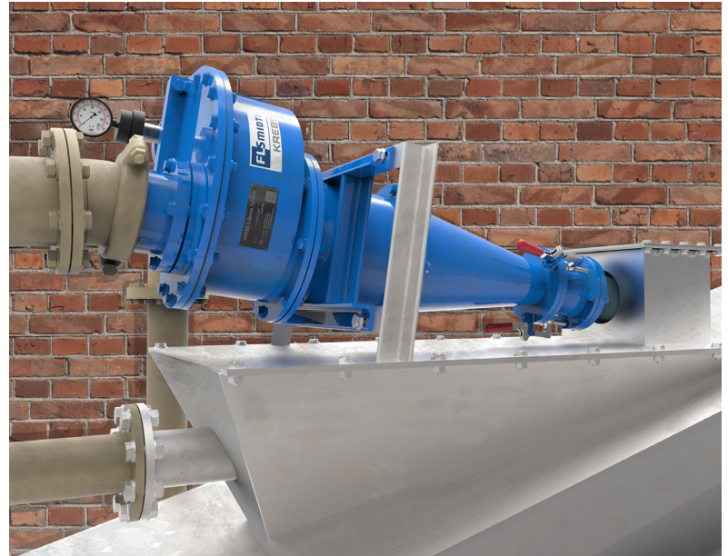
Krebs® Sewage Degritting Cyclone

FLSmidth Krebs cyclones are designed for superior separation and worry-free operation to remove solids from raw sewage and are less expensive than gravity based sedimentation systems. Our Sewage Degritting cyclones are designed to remove 98% or more of the grit entering the feed inlet that is larger than 150 mesh (105 µm). This performance advantage also comes with low footprint requirements. The cost savings are amplified when accounting for total installed costs versus gravity systems.