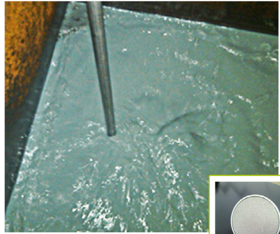
Ozone injected into fluids with special porous Stainless Steel Dispersion Stone