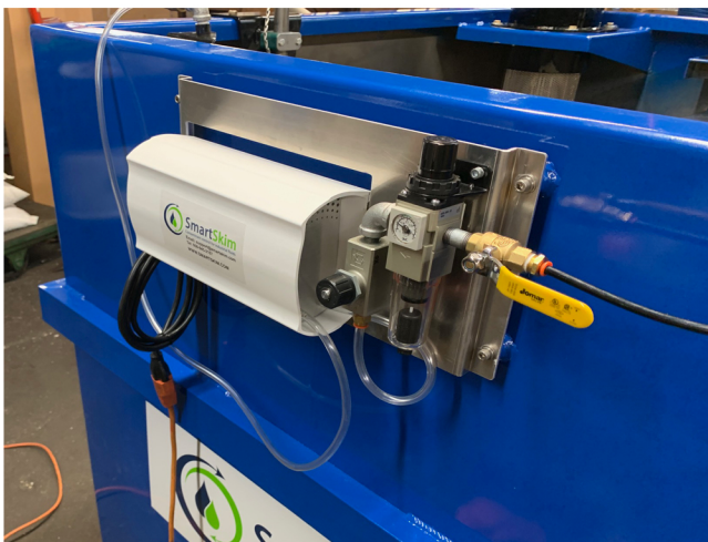
Ozone Generator retrofitted to central coolant system