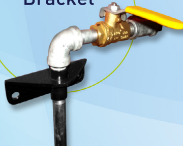
Valve & Bracket

As the ozone gas is dispersed through the fluid, the ozone instantly kills all forms of bacteria, fungus, yeast and mold on contact and then reverts to its original form: oxygen. The ozone generated does not alter the fluid in any way and does not harm the operators.